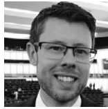
Rory Palmer was Labour MEP for the East Midlands from 2017 to 2020 and deputy city mayor of Leicester from 2011 to 2017. He is a member of the Fabian Society executive committee

To demonstrate that it is relevant and credible, Labour must become the party of aspiration – and one bellwether region shows how that can be done. Rory Palmer explains