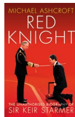
Michael Ashcroft Red Knight: The Unauthorised Biography of Sir Keir Starmer by Michael Ashcroft (Biteback Publishing, £20)

But the Conservative peer's claim that Starmer's father was 'petit bourgeois' is somewhat shaky especially because he never defines this slippery concept. More importantly, Ashcroft's account of Starmer's family background and life does not reflect a 'petit bourgeois' lifestyle. Sources quoted in Red Knight describe the Starmer's family home house as 'very modest'. Starmer went to Reigate Grammar School, which became a fee-paying school for most of the time he was a pupil there, but, as Ashcroft admits, the Labour leader attended the school free of charge. Finally, Starmer's gap year was very far from those enjoyed by middle-class youngsters. Instead of backpacking around Asia and