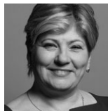
Emily Thornberry is the Labour MP for Islington South and Finsbury and Shadow Secretary of State for International Trade

The government has wasted a historic opportunity to build its post-Brexit trade deals around modern values. Labour would do things differently, argues Emily Thornberry MP